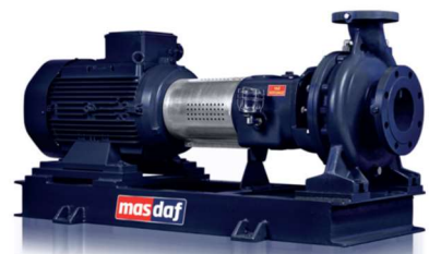
Industrial Electropump Group