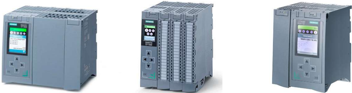
SIMATIC S7 - 1500