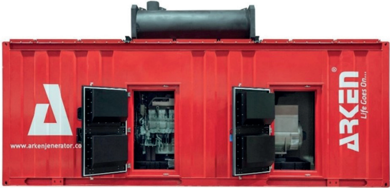
Low Voltage Generator