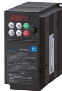
FVR - MICRO