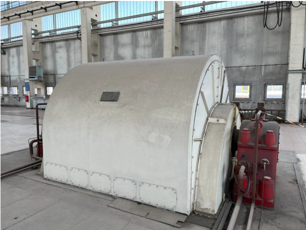
GANZ Synchronous Condenser Machine