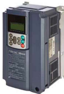
FRENIC - MEGA