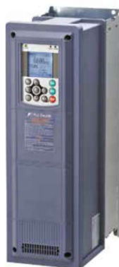
FRENIC – HVAC