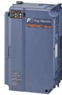
FRENIC – Ace - H