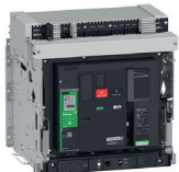
Circuit-breakers MasterPact MTZ