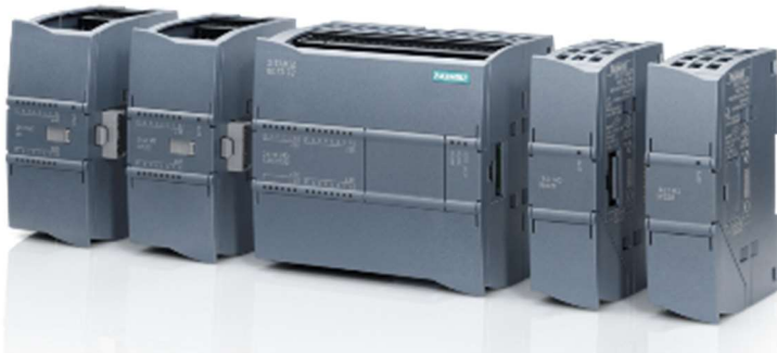
SIMATIC S7 - 1200