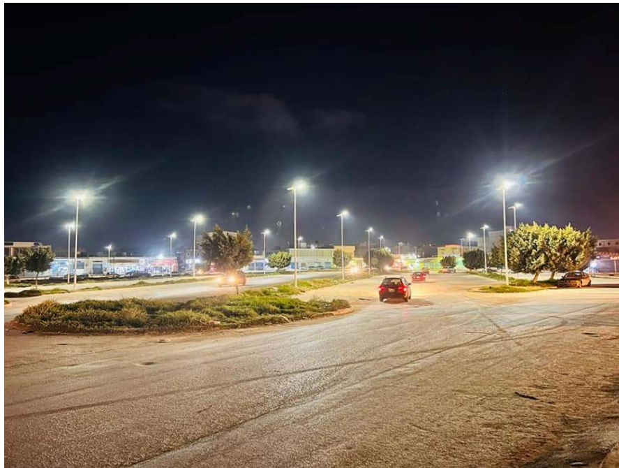
El Marj Municipality – Libya

Esavior Energy Savior, Save Mother Earth