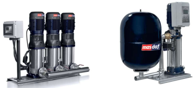
Pressor booster Unit